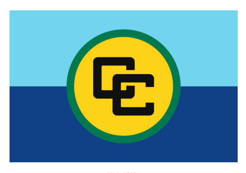
V14, 4/2021 Barbados Accreditation Council